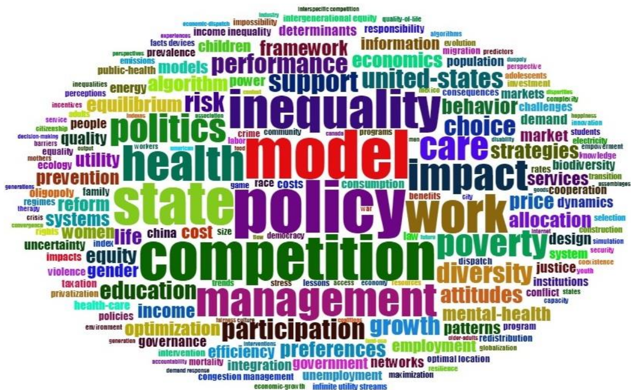
Figure 3. Word Cloud of Keyword Plus (1971-2020)