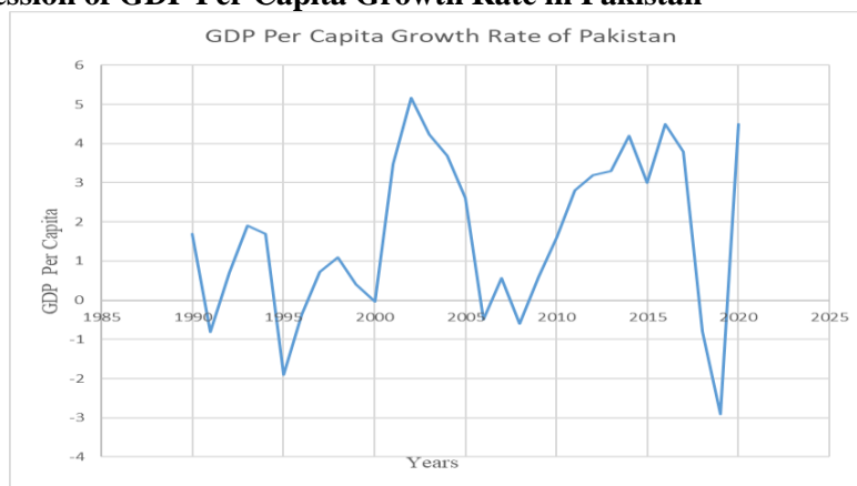
Figure: (3) GDP Per Capita Growth Rate of Pakistan since 1990-2020