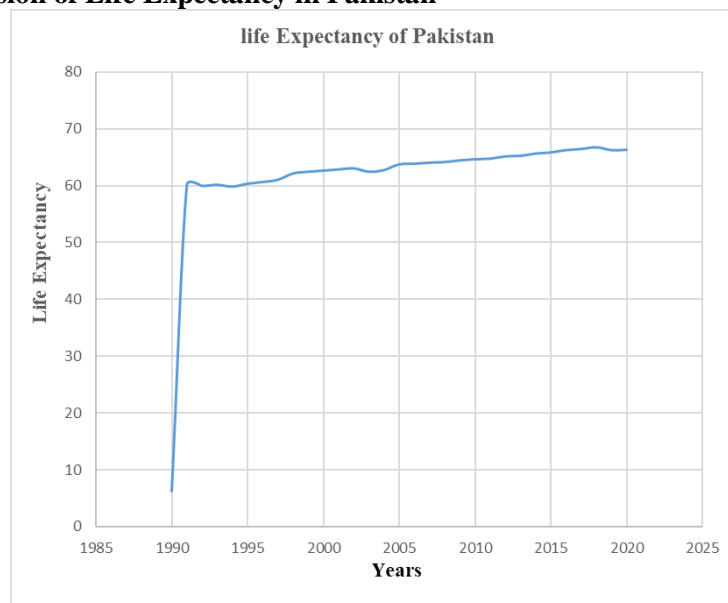
Figure: (1) Life Expectancy of Pakistan from the year 1990- 2020.